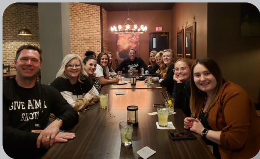
CRASHERS & Millennium Crew get acquainted at the after-hours social!

Development) Golf Classic with CUNA Mutual Group. (JK - it's one of our annual highlights not a spur of the moment initiative!) It was a wee bit chilly, and a few raindrops fell before it was over but sakes alive, the scenery, the comradery, and the hot coffee kept our spirits warm and our swings strong! Congrats to MCUCD on another FUNtastic FUNdraiser!