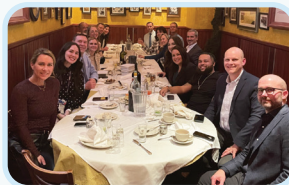
The Millennium crew networks with credit union friends over dinner.